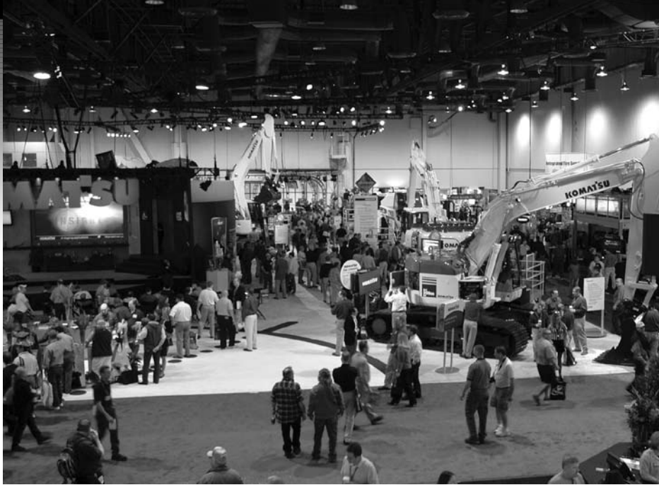
Komatsu always has one of the largest displays at CONEXPO. Twenty-four products will be available for attendees to check out at the 2008 event.

"We're very excited about the new features, and we believe that attendees will find them informative and helpful," said Tanel. "The Construction Challenge is one area we're particularly looking forward to as it showcases young people involved in the construction