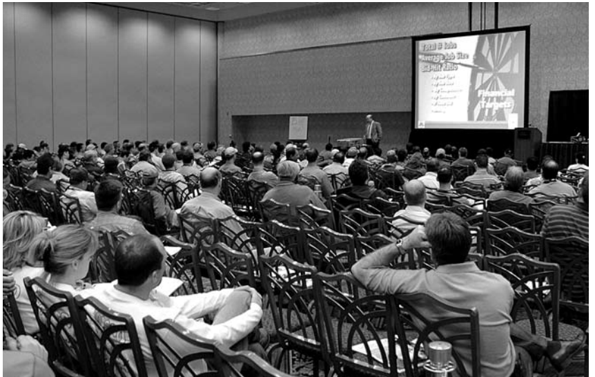
CONEXPO is more than just an equipment showcase. Attendees can learn more about the construction industry through educational programs in such areas as aggregates, asphalt, project management, equipment management, personal development and safety.

industry. We see this as a way to generate interest among youth and highlight for them the careers available in construction."