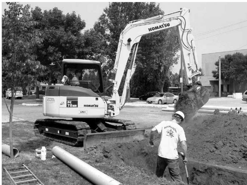
B&B Contracting runs several Komatsu excavators, including a compact PC78MR-6 used by Manager Brian Bellikka to dig a utility trench.

a large number of our nongovernmental customers continue to call us back repeatedly."